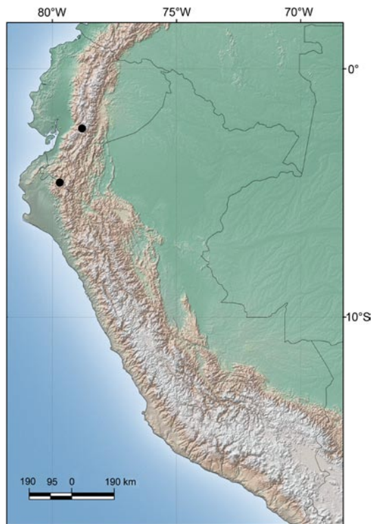
Fig. 1. Known distribution of Brachymitrium laciniatum (Spruce) A. K. Kop.

This new population was discovered in a cloud forest formation known as Bosque de Cuyas in north-eastern of Piura department. The forest covers an area of 600 hectares and it is one of the most intact forests in the region. The annual 1000 mm of rainfall is concentrated mostly from