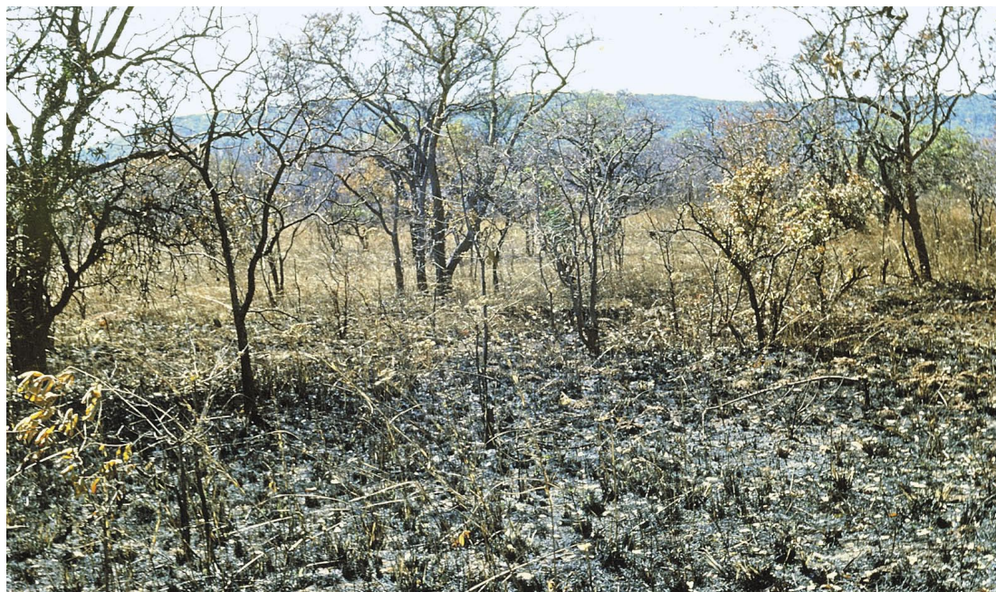
Fig. 8. Miombo woodland after a fire. Lusaka region; on horizon is Leopards Hill, 28 June 1972.