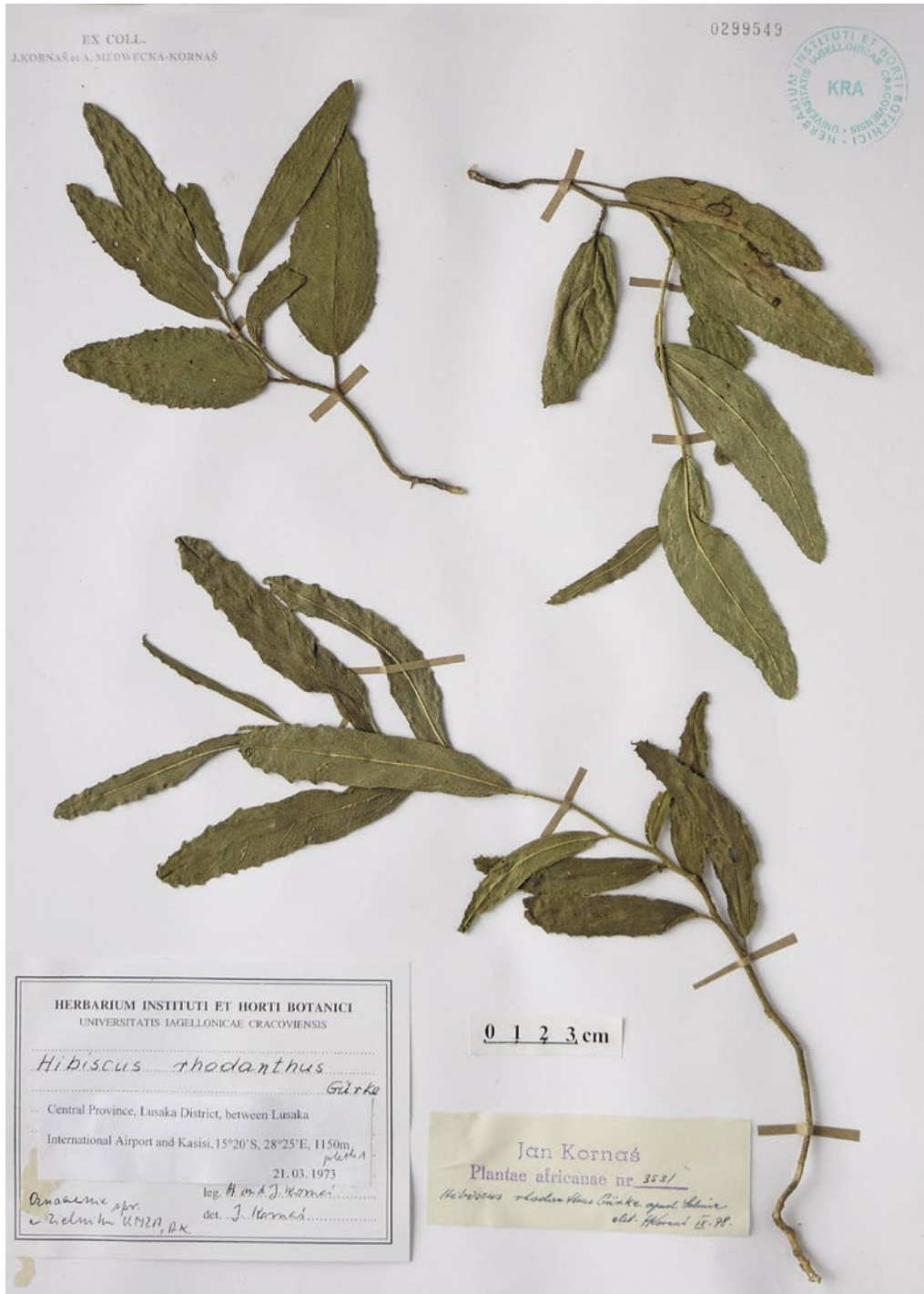
Fig. 5. Hibiscus rhodanthus Gürke ex Schinz in full development of vegetative parts, 21 March 1973, end of rainy season, KRA 3531.