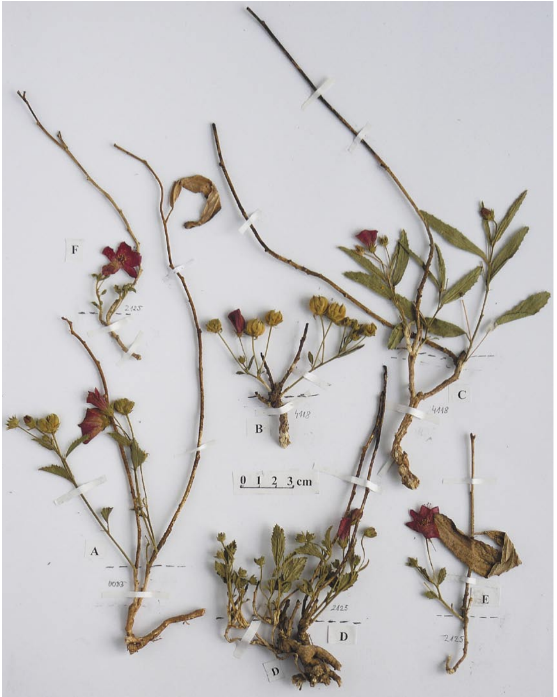
Fig. 4. Hibiscus rhodanthus Gürke ex Schinz – stages of blooming and fructification. Note swollen stem bases and stems with leaves from previous years, September 1972, end of dry season. Near and on Lusaka University campus (A – KRA 0083, B, C – KRA 4118, D, E, F, – KRA 2125).