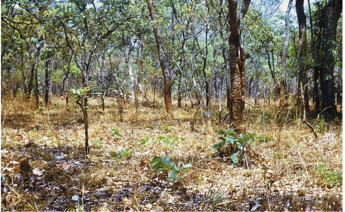
Fig. 10. Miombo woodland, regeneration of various plants (also trees) after a fire. Ndola Nature Reserve, area of burning experiments, 29 September 1972.

blooming of Hibiscus rhodanthus . Its pyrophytic character is therefore confirmed.