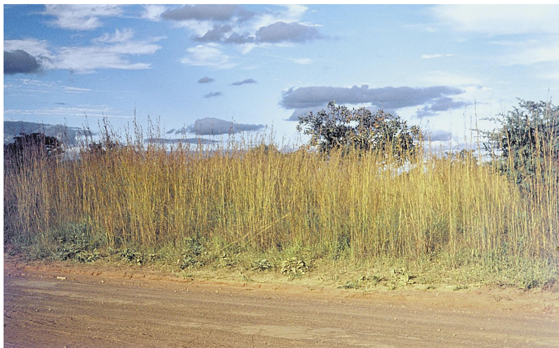
Fig. 9. Lusaka region, observation plot no. 1. Under yellow drying grasses are small pyrophitic plants, April 1973, beginning of dry season.