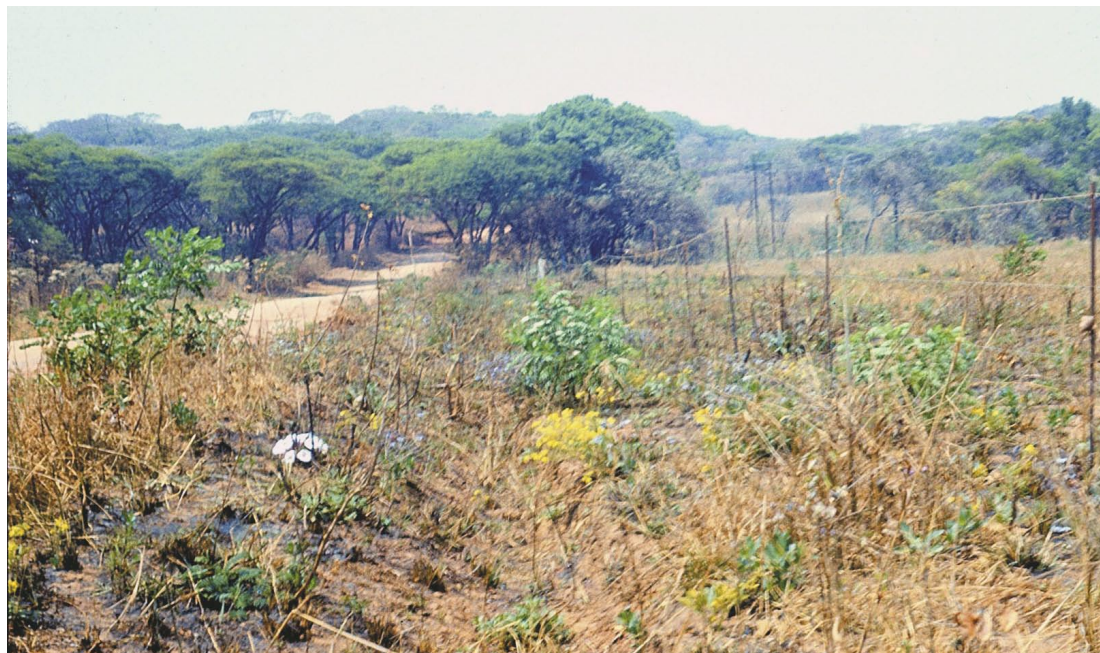
Fig. 6. Road to Leopards Hill, 24 km ESE of Lusaka. In the foreground, savanna burned some weeks before; at far end, miombo woodland, September 1972.

8. Leopards Hill Road, ca 24 km ESE from Lusaka, recently burned pasture on roadside, 24 September 1972, flowers (Fig. 1).