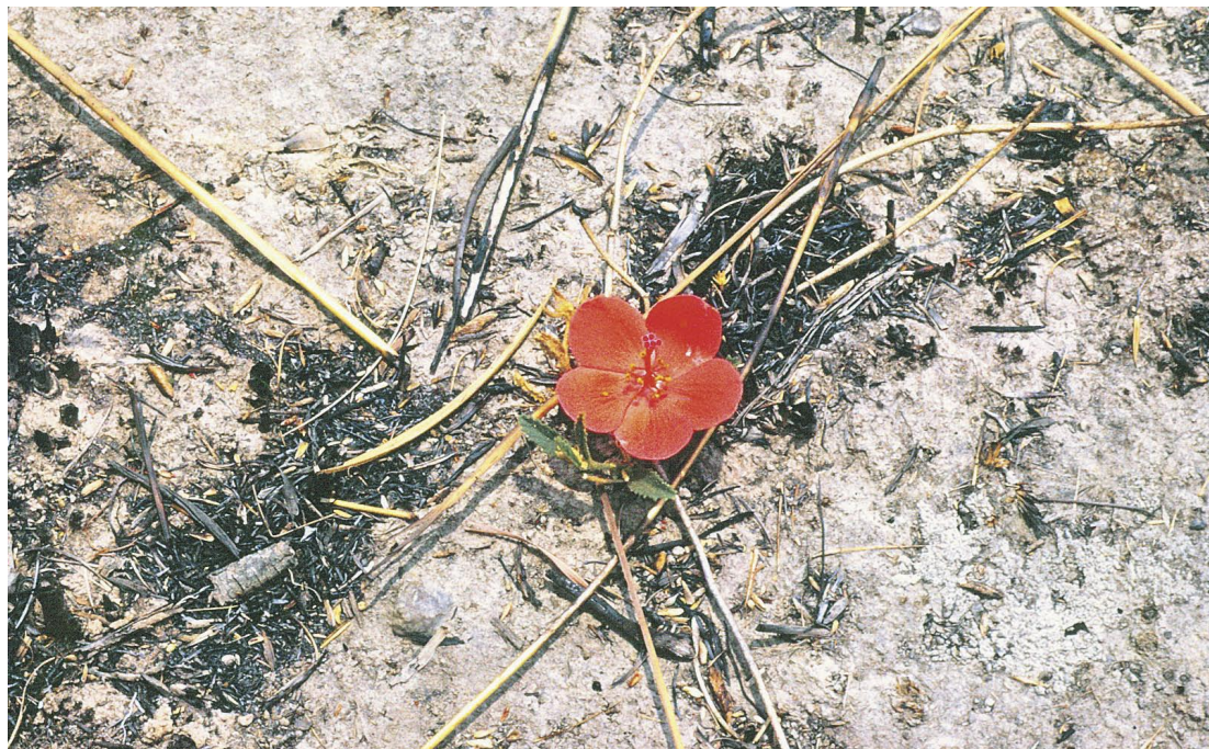
Fig. 2. Hibiscus rhodanthus Gürke ex Schinz in open miombo woodland near Kafue National Park, October 1971 (locality no. 2).