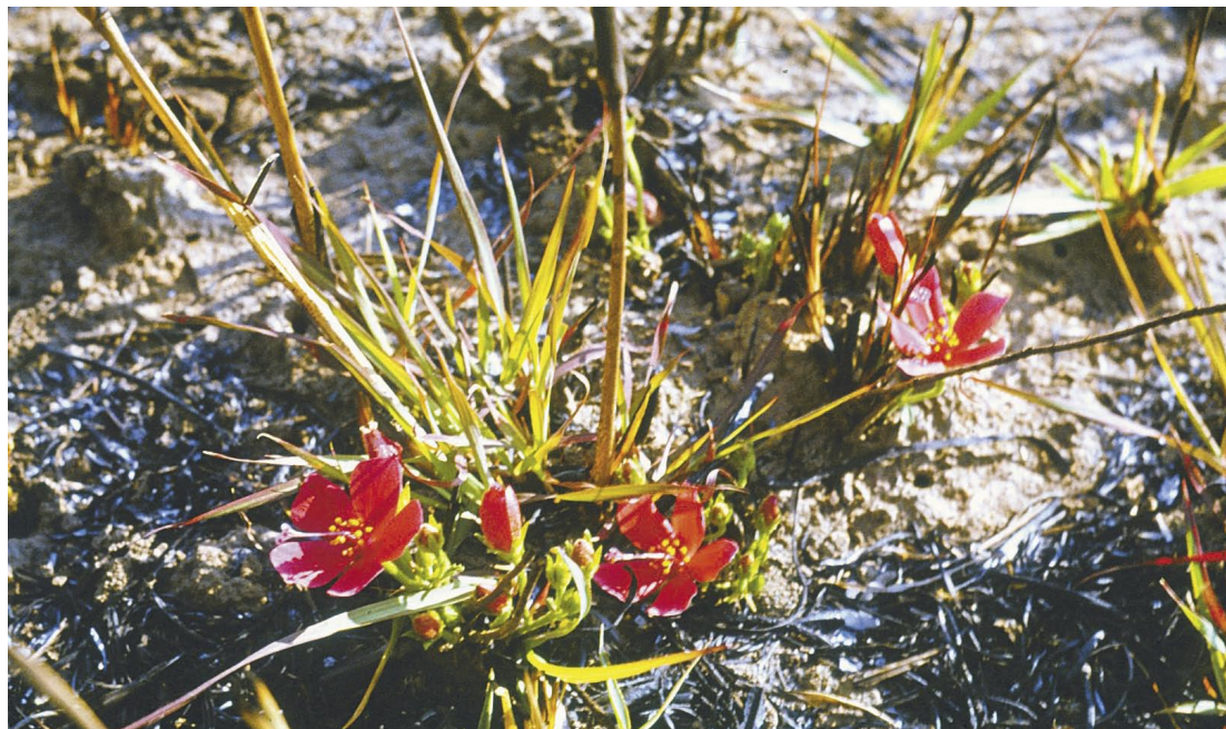
Fig. 1. Hibiscus rhodanthus Gürke ex Schinz in burnt savanna, September 1972 (locality no. 8).