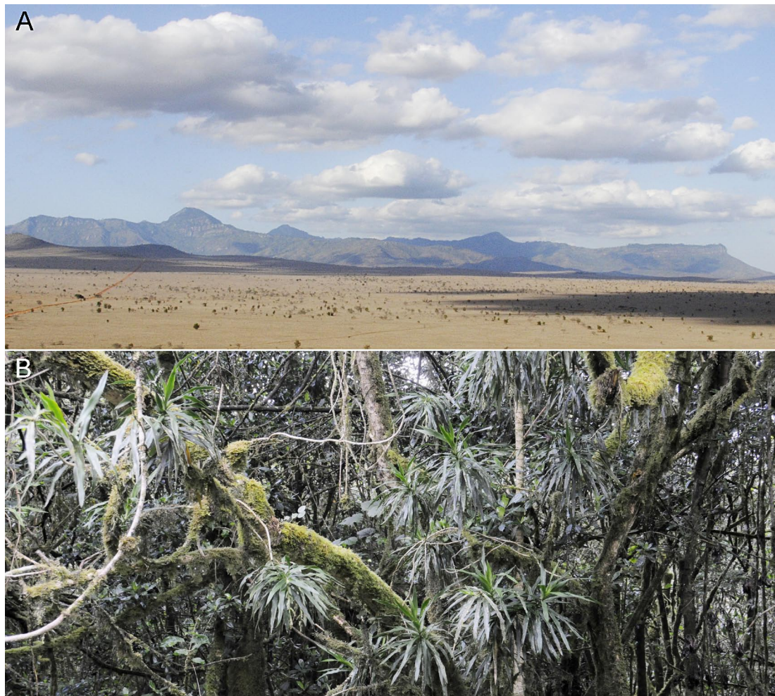
Fig. 3. Taita Hills. A – the mountains as seen from the southwest during the dry season in September 2012, B – moss-rich montane forest near the summit of Vuria, the highest peak of the Taita Hills.

nanii , Sorindeia madagascarensis , Teclea trichocarpa , Xymalos monospora , and Ficus sp. UTM 462044, 9576252. 1150 m. 16 Jan. 2010. Rikkinen 10K433 .