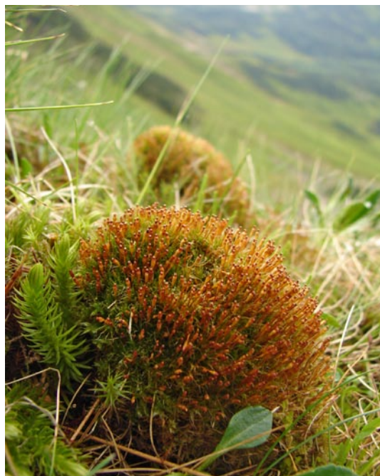
Fig. 1. Tetraplodon angustatus (Hedw.) Bruch & Schimp. at Pysznińska Przełęcz pass in the West Tatra Mts, 9 June 2007.

component of the montane moss flora, previously recorded only from the Sudetes (Limpricht 1867, 1930; Milde 1869; Berdowski 1974), and Góry