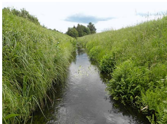
Fig. 2. Sampling site of Batrachospermum atrum (Hudson) Harvey.

flowing through a forest and in some sections through intensively used meadows.