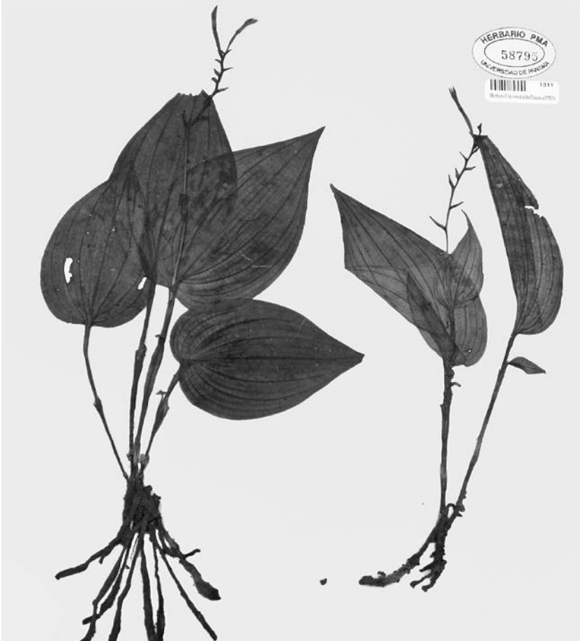
Fig. 2. Monophyllorchis isthmica Kolan., sp. nov. – habit.