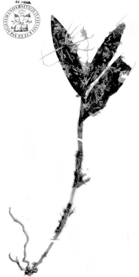
Fig. 2. Holotype of Epidendrum dukei Kolan. & Mystkowska, sp. nov.

HOLOTYPE: PANAMA. Prov. Darién. Rio Balsa between Manene and Guayabo, 8 Nov. 1967, J. Duke & N. Nickerson 14950 (MO).