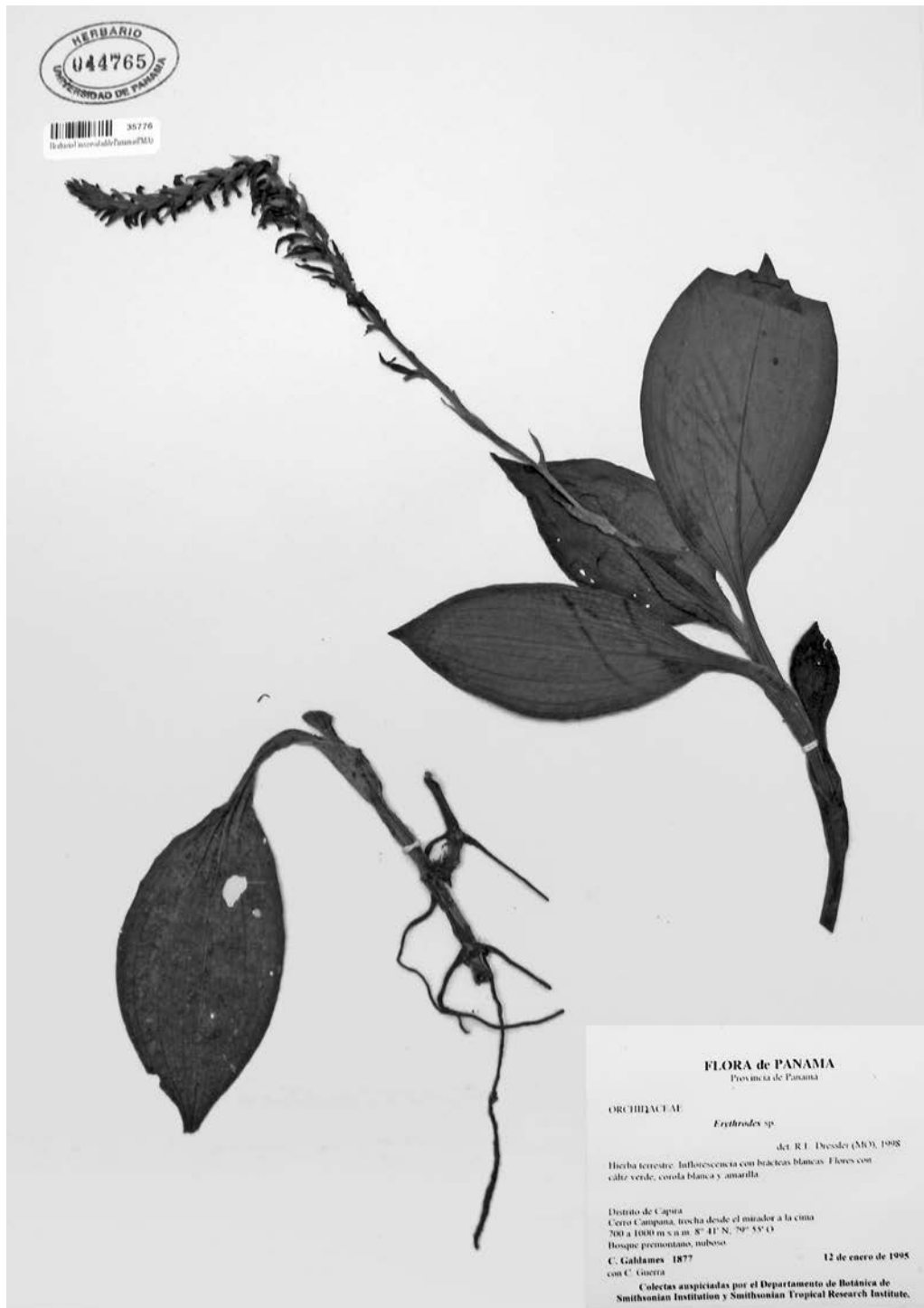
Fig. 2. Microchilus campanensis Kolan., sp. nov. – holotype.