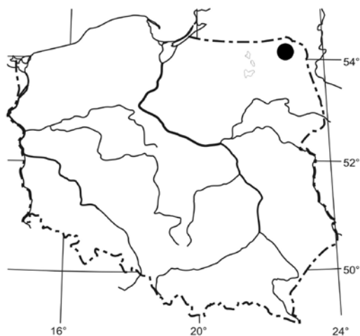
Fig. 1. Distribution of Panaeolus subfirmus P. Karst. in Poland.

Basidiomata generally scattered. Pileus 15–50 mm, first convex to conical then expanded-conical, expanded-convex to plane-convex or nearly plane, with somewhat deflexed margin exceeding gills, distinctly hygrophanous, honey-brown to honey-grey, fading to ochraceous, pale grey or cream, with darker brown submarginal zone and center often tinged tawny-buff when dry entirely greyish or pale ochraceous-buff, matte, sometimes slightly rugulose or even cracked in places. Lamellae, L = 20–30, I = 3–5, medium-spaced to fairly crowded, ventricose to broadly ventricose, adnate to seceding, first milky coffee then brownish, dark brown and blackish, clearly mottled, with conspicuously white flocculose edge. Stipe 30–165 \times 3–5 mm, cylindrical or slightly evenly thickening towards base and upwards,