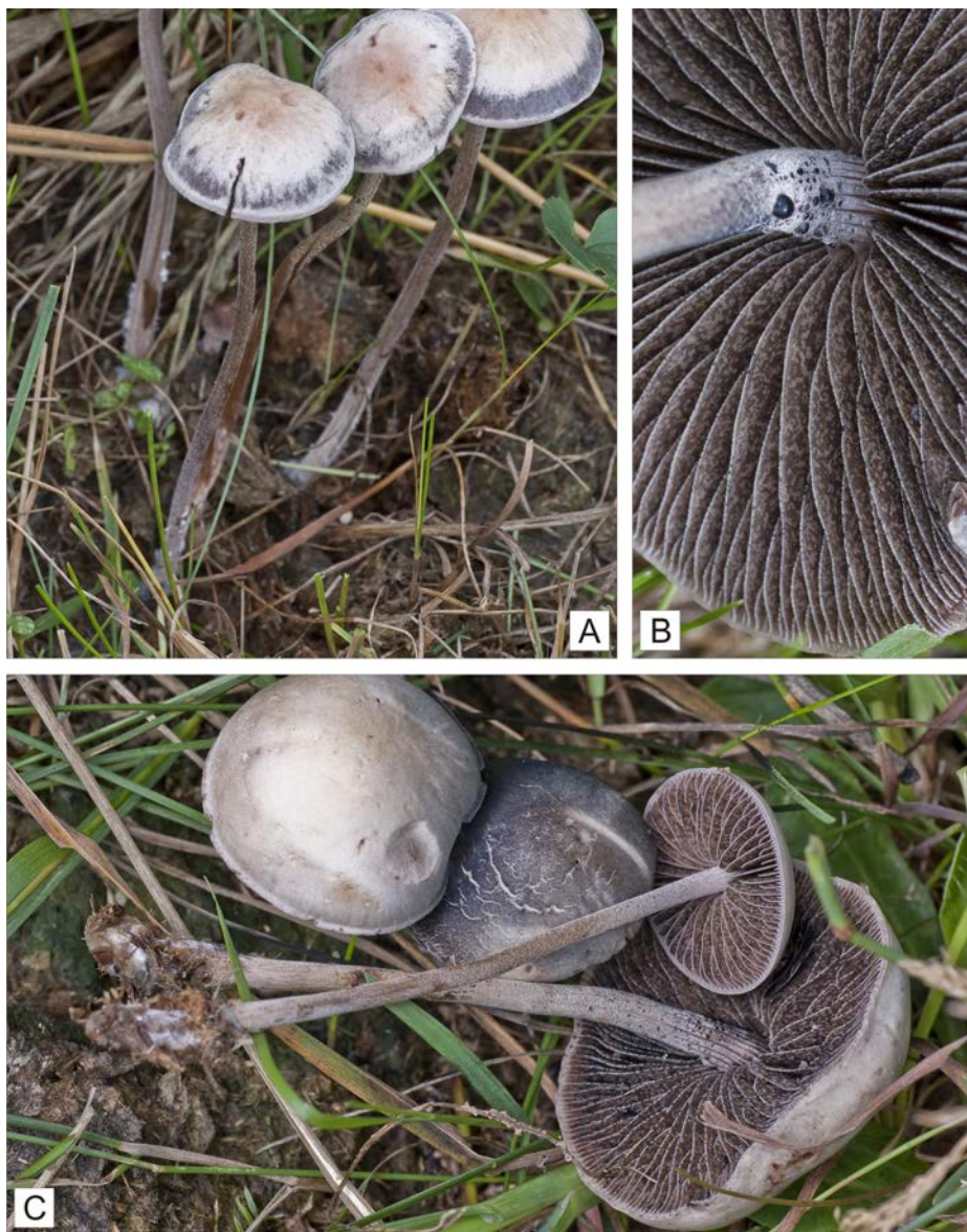
Fig. 2. Panaeolus subfirmus P. Karst. Top, side and bottom views of basidiomata (A & B – WRSL 22072012.394; C – WRSL 22072012.394 & 22072012.503).

flexuous. Another type of \pm short broadly clavate cheilocystidioid element also present rarely. Pleurocystidia absent. Chrysocystidia-like sulphidia absent. Caulocystidia (22.7) 46.3 \pm 11.1 (76.7) \times (3.9) 6.4 \pm 1.3 (11.6) \times (3.3) 5.5 \pm 1.1 (8.5) \mu\text{m} , 32.7\text{--}60.4 \times 4.8\text{--}8.3 \times 4.1\text{--}6.8 \mu\text{m} ( n = 130 ), abundant, present at apex, similar to cheilocyst-