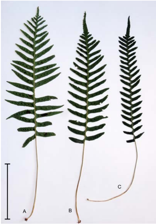
Fig. 1. Leaf outline: A – oval of Polypodium interjectum Shivas (Wąwóz Lipa Nature Reserve), B – lanceolate of P. x mantoniae Rothm. (Swarna Góra), C – linear of P. vulgare L. (Bogdaszowice).

P. x mantoniae , growing in the deep narrow gorge of a small stream. The gorge is carved in greenstone open to the south and protected from cold north-west and north winds. The population colonizes