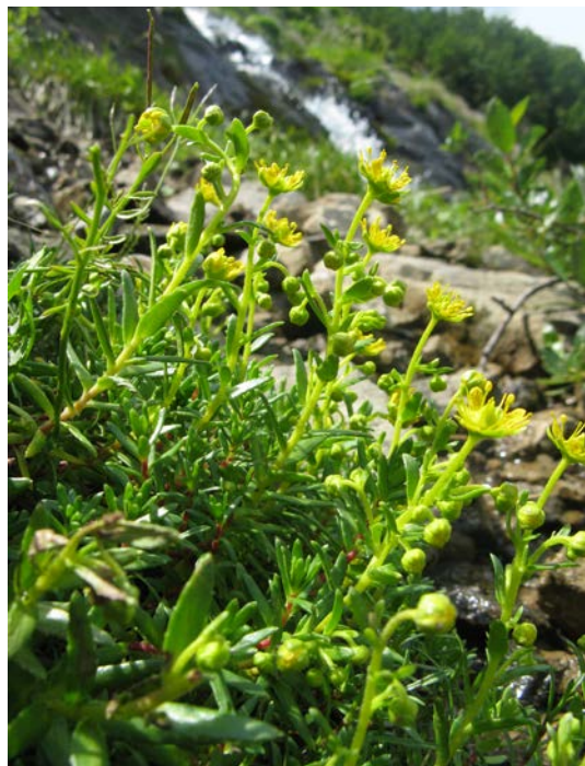
Fig. 3. Saxifraga aizoides L. on a stream bank in the Chornohora Mts.

unshaded and is exposed to insolation for a large part of the day. The density of flowering shoots of S. aizoides is the highest there ( 687 \pm 42 per m^2 ).