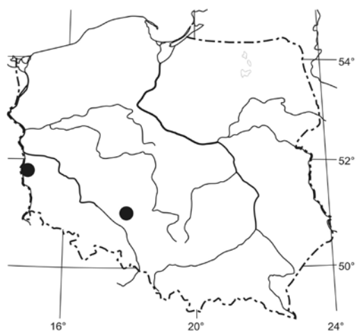
Fig. 1. Known distribution of Agrocybe putaminum (Maire) Singer in Poland.

Basidiospores (9.6) 11.7 \pm 0.7 (13.8) × (5.7) 7.0 \pm 0.4 (8.2) \mu\text{m} , 10.8–12.6 × 6.6–7.4 \mu\text{m} , Q = (1.3) 1.7 \pm 0.1 (2.2), Q = 1.5–1.8, n = 412, ellipsoid to oblong (frequently with adaxial side slightly less convex than abaxial side), smooth, moderately thick-walled up to 0.8 \mu\text{m} , with apical germ pore up to 1.2 \mu\text{m} wide, yellow-brown in ammonia. Basidia (24.6) 33.8 \pm 3.5 (42.2) × (7.9) 10.6 \pm 1.1 (13.5) \mu\text{m} , 29.8–37.9 × 9.3–12.2 \mu\text{m} , n = 72, narrowly clavate, 4-spored. Cheilocystidia (31.9) 44.5 \pm 6.7 (63.9) × (8.3) 11.1 \pm 1.3 (14.9) × (4.6) 6.6 \pm 1.0 (9.3) \mu\text{m} , 36.2–53.6 × 9.7–12.8 × 5.3–7.8 \mu\text{m} , n = 101, mostly lageniform to narrowly utriform (sometimes subcapitate), rarely clavate, sometimes with yellow-brown refractive content, thin-walled. Pleurocystidia (23.0) 38.9 \pm 7.7 (56.9) × (13.5) 19.2 \pm 3.1 (27.0) × (6.7) 13.4 \pm 3.4 (21.3) \mu\text{m} , 29.0–48.0 × 14.9–23.5 × 9.4–17.7 \mu\text{m} , n = 61, scattered to abundant, narrowly to broadly utriform or clavate, sometimes with crystals at apex and with yellowish brown refractive content, thin-walled. Pileipellis an irregular hymeniderm with transitions to an epithelium of erect, irregularly clavate, elements (not measured). Pigment pale yellow to brown, encrusting or parietal. Pileocystidia scattered to abundant, (21.1) 45.1 \pm 10.4 (75.7) × (5.8) 9.8 \pm 2.0 (16.1) × (3.1) 5.4 \pm 1.0 (7.8) \mu\text{m} , 34.2–59.3 × 7.6–12.5